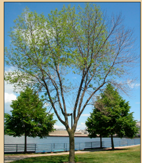
Figure 2. Characteristic thinning and dieback in an infested ash.

Emerald ash borer continues to be found at low levels after large ash trees in an area have died. EAB has been found in trees as small as one inch in diameter and will infest small ash as they grow larger.