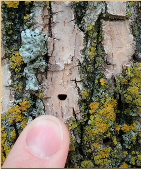
Figure 3. D-shaped exit hole.

Damage typically starts in the upper tree canopy and is light in intensity. Lightly-damaged ash usually have heavy damage within a few years, indicating imminent tree death.