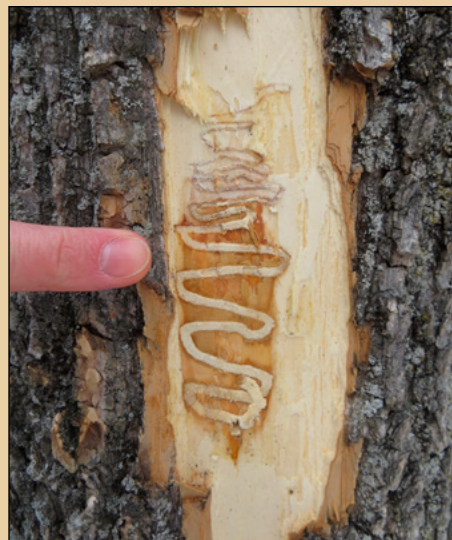
Figure 1. Winding galleries created by EAB larvae beneath the bark of an ash tree.

Adult beetle emergence begins in southern Wisconsin in late May. Populations may increase rapidly, as each female beetle lays between